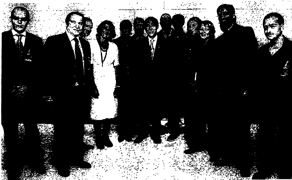
2011 WINNERS OF THE AWARD WITH UN SECRETARY-GENERAL BAN KI-MOON