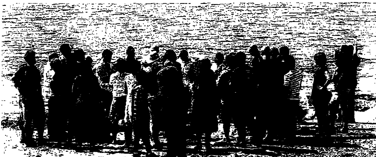
MEDIA TOURS - DUAL NARRATIVE TOURS TO ISRAEL AND PALESTINE. 2011 Winner. 1 st Place