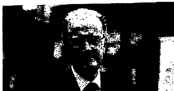
PRESIDENT JORGE SAMPAIO High Representative for the United Nations Alliance of Civilizations Patron of the Intercultural Innovation Award

All ten finalists will receive recognition and visibility. Furthermore, the top five projects will draw on one-year active guidance and support from the UNAOC and the BMW Group in order to replicate and expand the range of action of their projects. They will also benefit from the help of the Mentorship Group. This support may vary depending on the nature of the project and may include IT support, legal advice, increased visibility, etc.