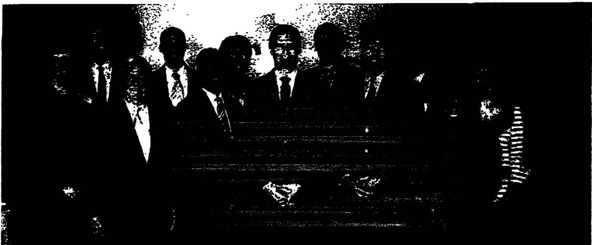
THE MAYTREE FOUNDATION, 2011 Winner, 2 nd Place